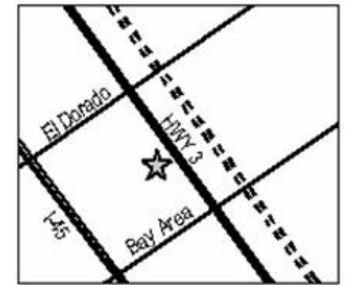
Located in Clear Lake on Hwy 3 between El Dorado and Bay Area Blvd.